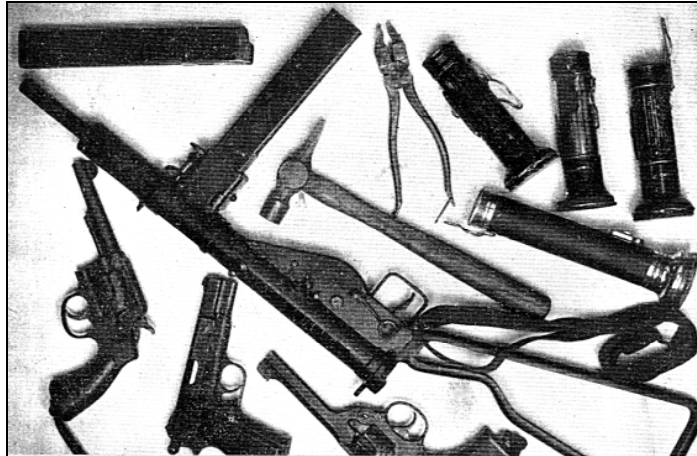
Tools used by groups in the field at dropping place when weapons came down from a RAF/SOE weapon planes.