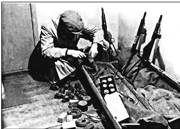
Weapon containers have arrived to the first dump. A man from the Movement is unpacking ammunition and explosives. After doing this the materiel was packed and prepared for transport to the resistance- and sabotage groups around the country.