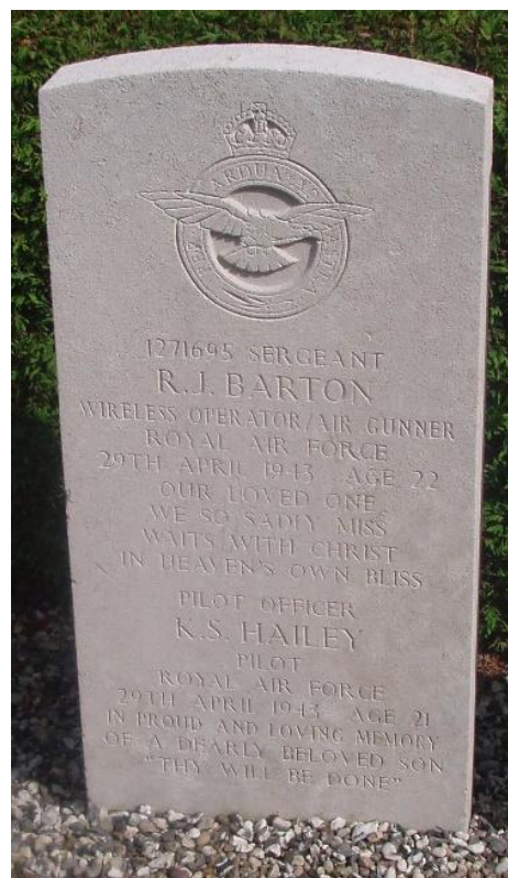
The headstones in Aadum Churchyard