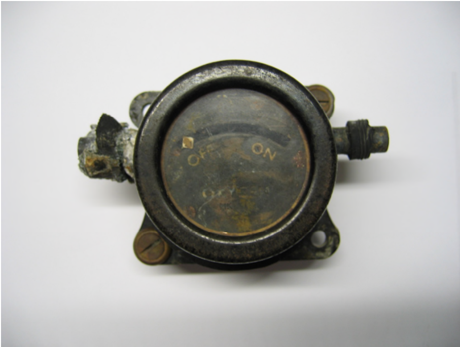
Oxygen flow indicator mk. II