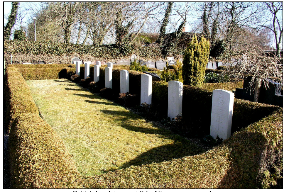
British headstones at Sdr. Nissum graveyard.