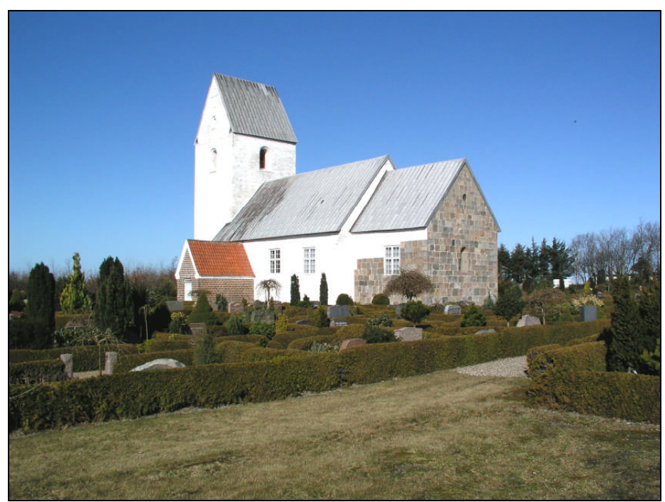
Sdr. Nissum church. West Coast of Jutland.

At the graveyard there are graves with two sailors and one soldier. Also there are graves with crewmembers from RAF Squadrons No. 18, 110, 138, 298 and 619.