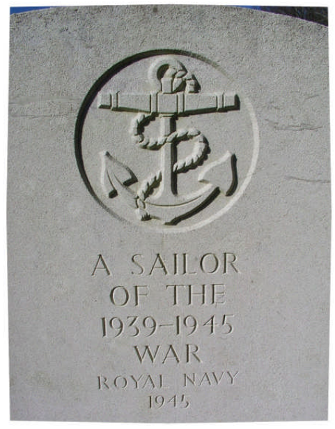
Headstones placed on graves with unknown British soldiers.