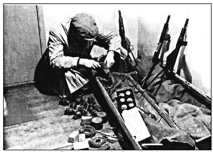
Weapon containers have arrived to the first dump. A man from the Movement is unpacking ammunition and explosives. After doing this the materiel was packed and prepared for transport to the resistance- and sabotage groups around the country.